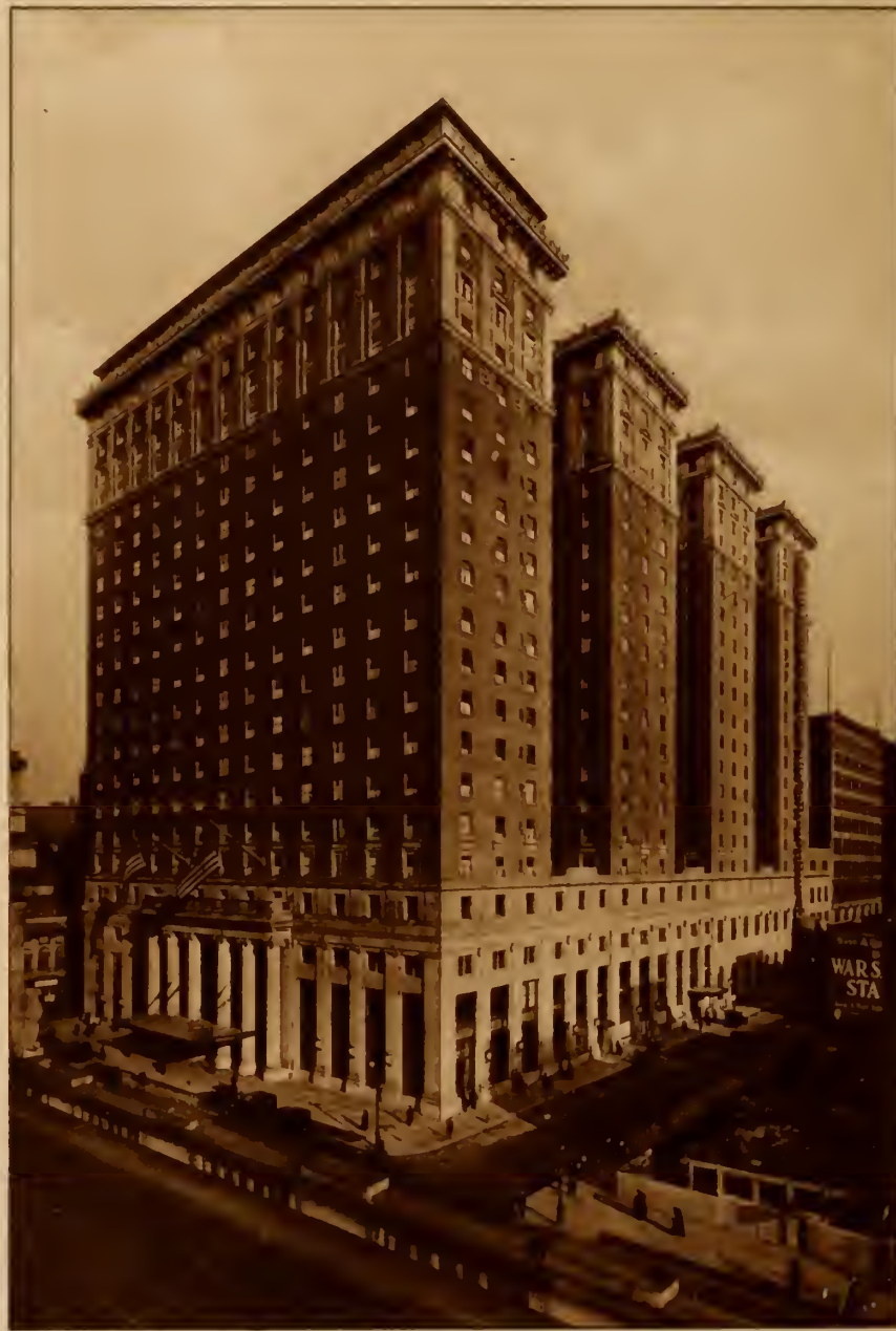
PENNSYLVANIA HOTEL. One of the world's largest hotels, the finest of the chain of Statler Hotels. A popular meeting place for New Yorkers. Has 2200 rooms.